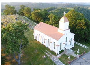
Saint Joseph Mission 64 Frohnafel Lane Proctor, WV 26055