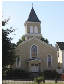
Holy Rosary Mission 519 Main Street Sistersville, WV 26175