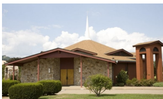
Saint Vincent de Paul Parish 21 Rosary Road New Martinsville, WV 26155